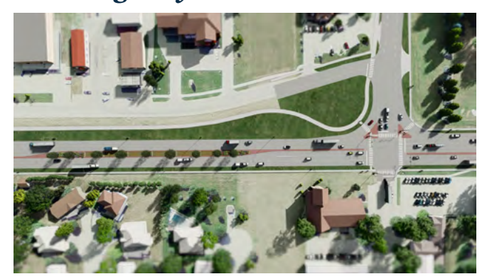
Presented by MURRAY HULSTEIN & ADAM FEDDERS

"Road Work Ahead: A Look at Highway 75 Reconstruction in 2023"