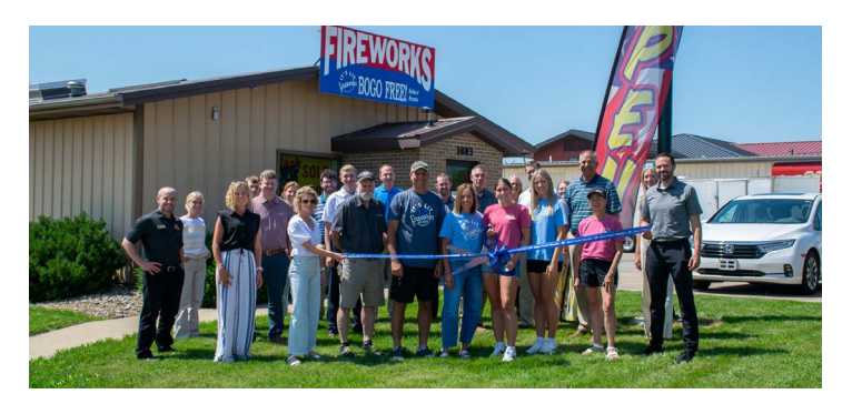
It's Lit Fireworks