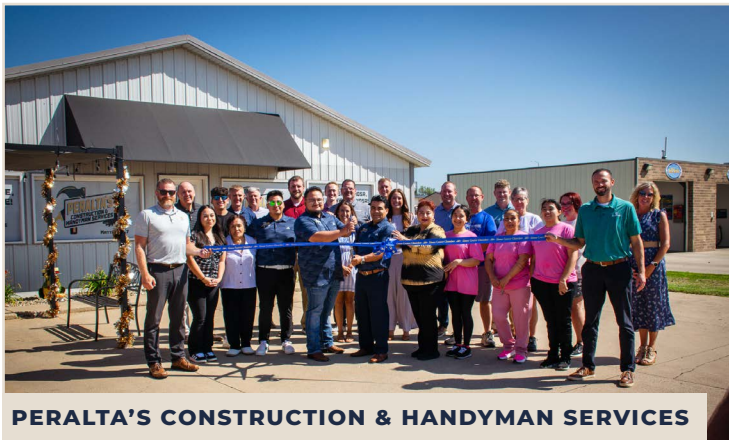
PERALTA'S CONSTRUCTION & HANDYMAN SERVICES