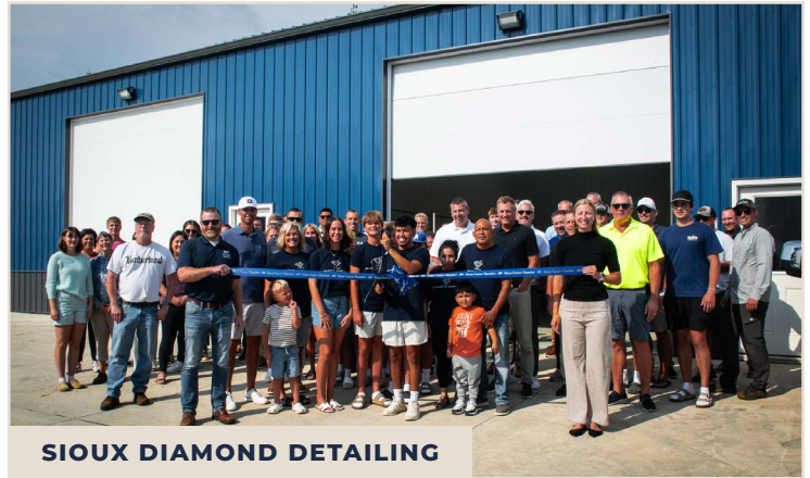
SIOUX DIAMOND DETAILING