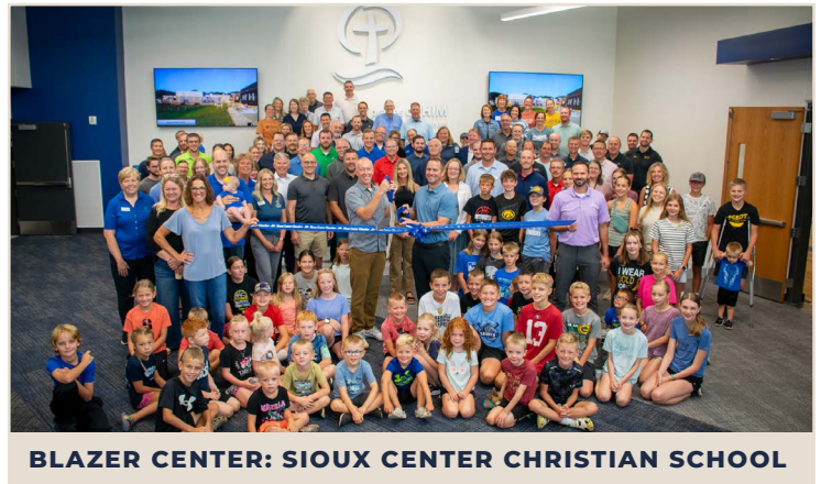
BLAZER CENTER: SIOUX CENTER CHRISTIAN SCHOOL