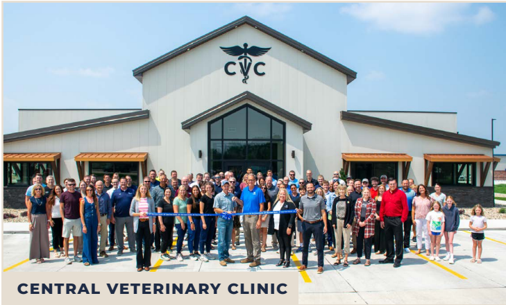
CENTRAL VETERINARY CLINIC